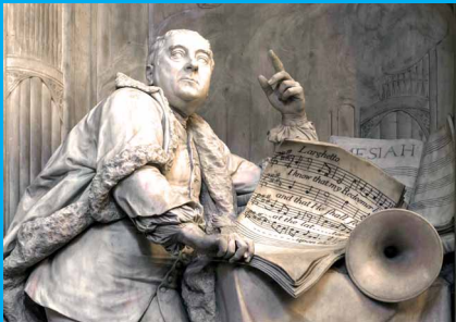
Sculpture of Handel by Roubiliac in Westminster Abbey. It features the score of I know that my Redeemer liveth .