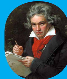
Beethoven, by Stieler, 1820