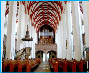
The interior of the Thomaskirche, Leipzig where Kuhnau was Bach's predecessor as Kantor.